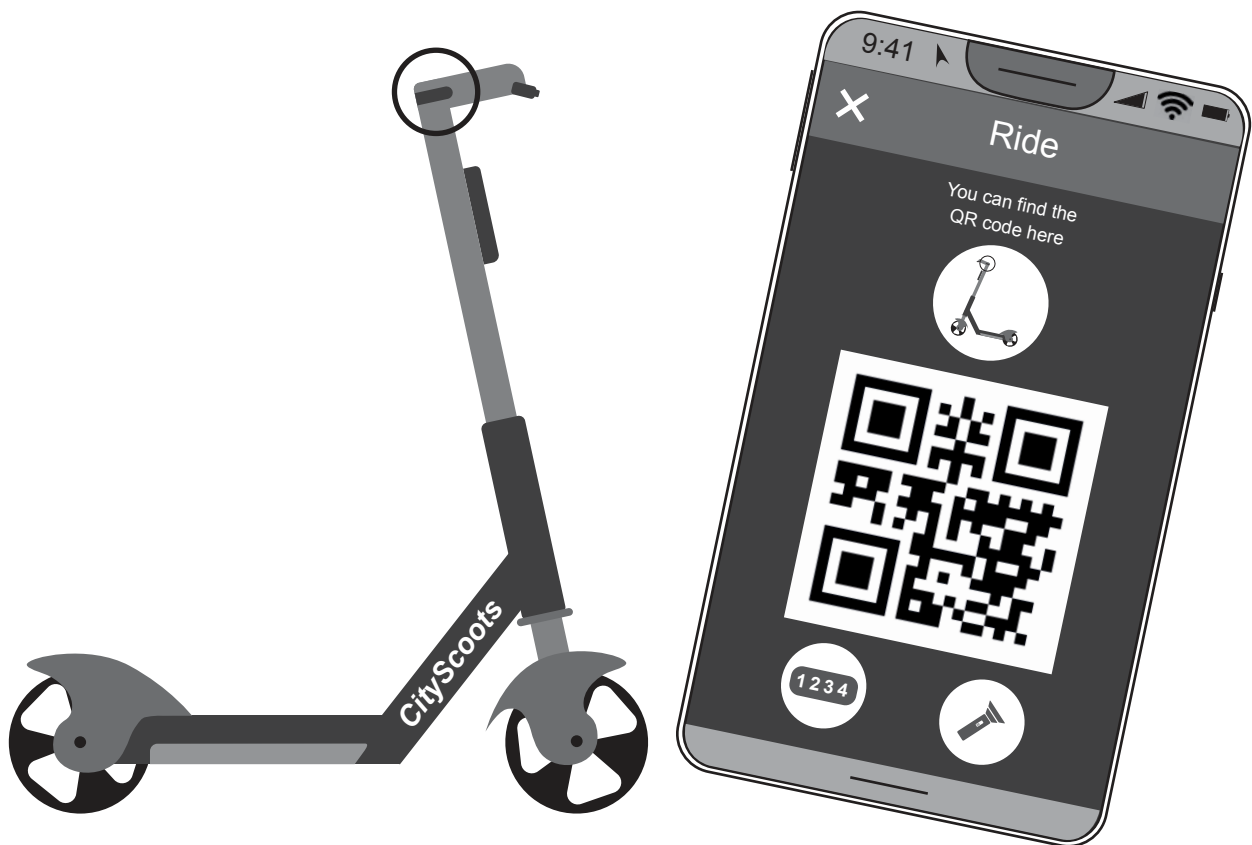
Figure 1: The CityScoots e-scooter and app

Customers can also use the CityScoots app to locate the nearest e-scooter by looking at the map on their cellphone (mobile phone). The app also provides possible routes to reach the e-scooter and its remaining battery life (see Figure 2 ).